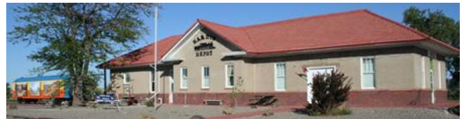
The Historic Hardin Depot

A block of rooms have been reserved for the Reunion at the Hilton Garden Inn in Billings, MT. You can make reservations through the hotel under the Reno/Reneau Reunion. Use Code RRR. We will have a Hospitality Room on the 23 rd where we will register and meet and greet new and old Reneau descendants.