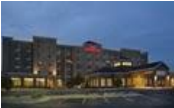
Hilton Garden Inn, Billings MT

Our Reunion Team has looked into other venue options due to limited lodging space in Hardin, MT. We have come up with what we think will work nicely for our group!