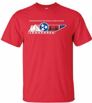
Red T Shirt

Below are the sizes and prices for T-shirts. purchase. Please help defray the costs of the Reunion with a purchase of a shirt. Enclose with Registration Form. All shirt orders must be must be paid by the August 15, 2025.