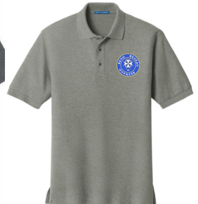
Cool Gray Polo Shirt