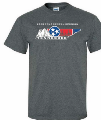
Dark Gray T Shirt