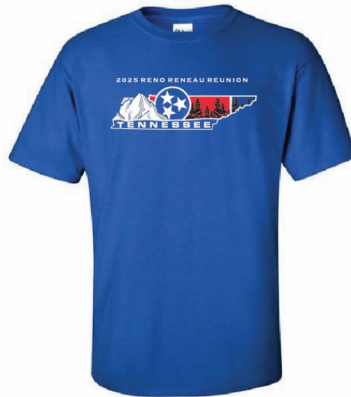
Blue T Shirt